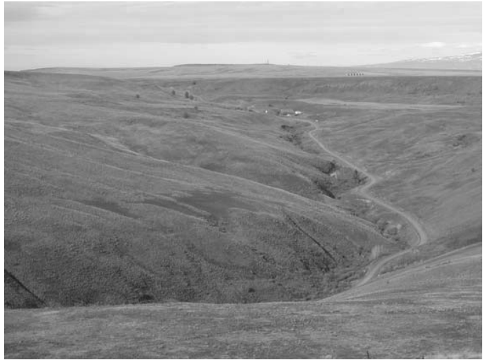
Dot Road before her facelift

County road improvements for deliveries and access to the site are scheduled to begin August 2006 with completion scheduled for October 2006.